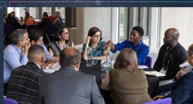
ROUNDTABLE SPONSORSHIP (EXCLUSIVE AND NON-EXCLUSIVE)