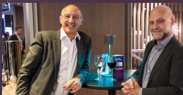
DRINKS RECEPTION SPONSORSHIP