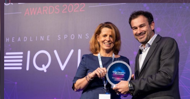
SOCIAL MEDIA SPONSORSHIP

PLEASE NOTE, BESPOKE SPONSORSHIP PACKAGES ARE AVAILABLE ON REQUEST